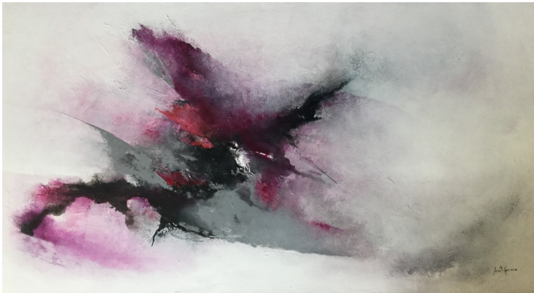
Fleeting Acrylic 31.4 x 59 in