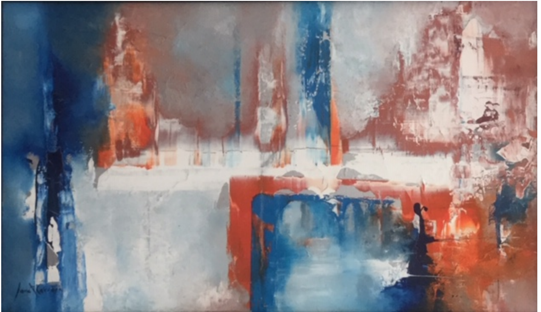
Road of Flowers Mixed, 2020 27.5 x 47.2 in