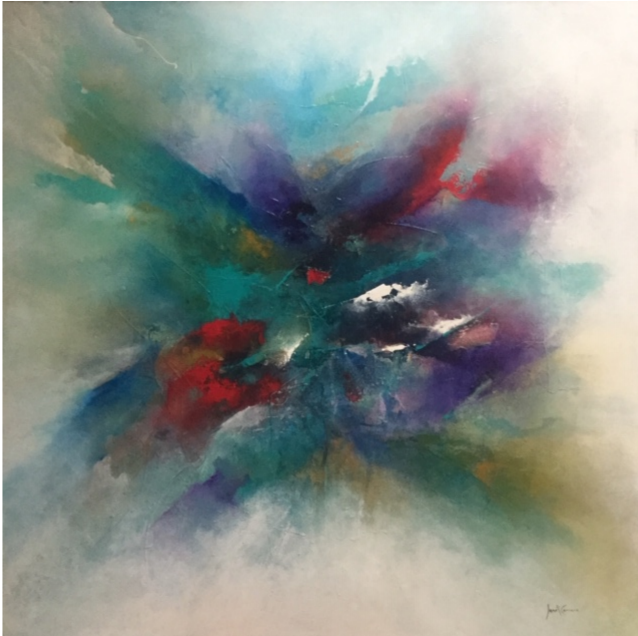
Transformations Acrylic 59 x 59 in