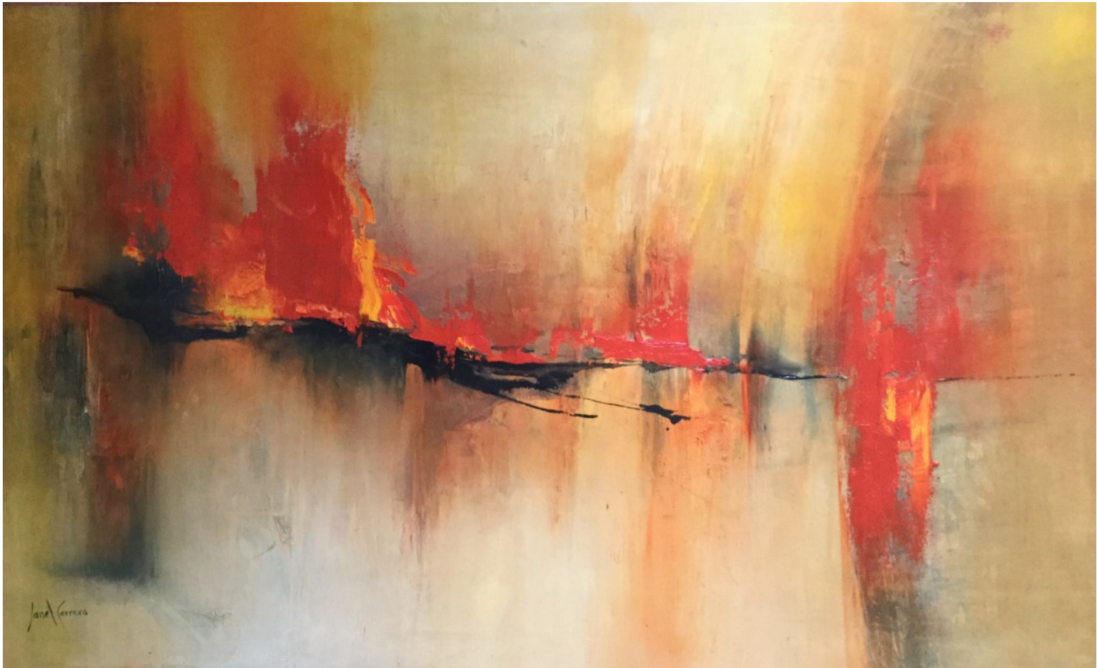
The Bridge Oil, 2017 31.4 x 47.2 in