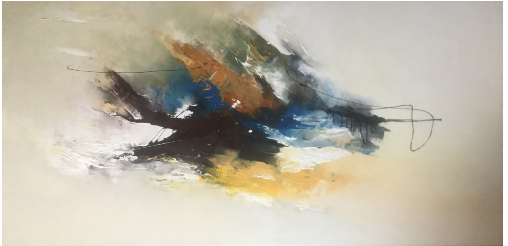
Silence Acrylic, 2019 39.3 x 78.7 in