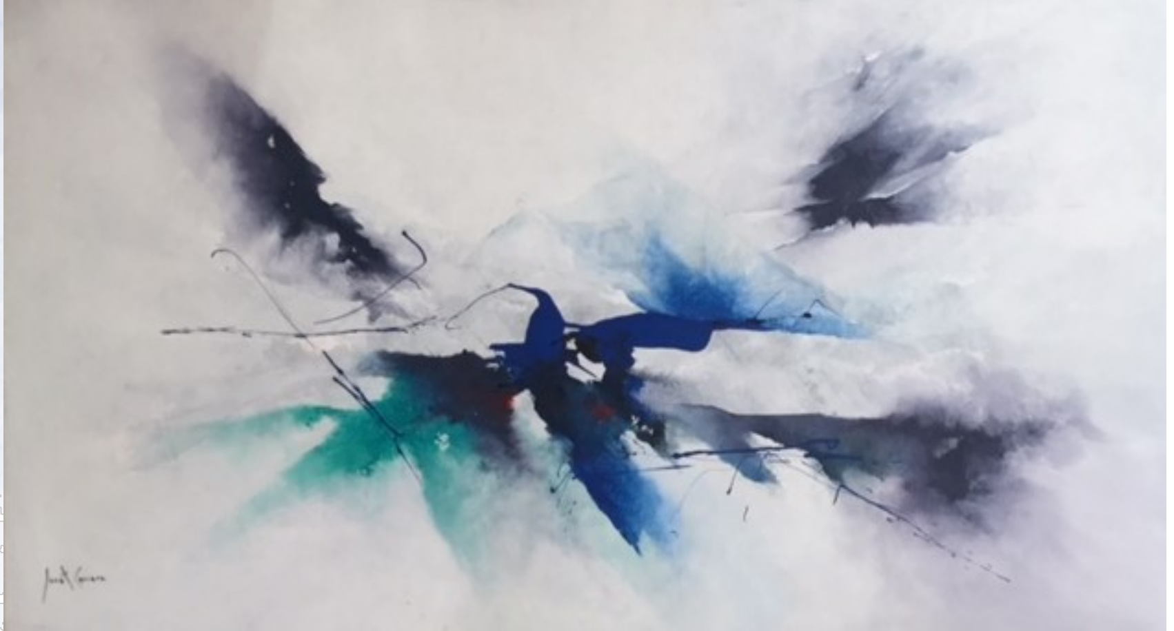
Life Path Acrylic, 2019 31.4 x 59 in