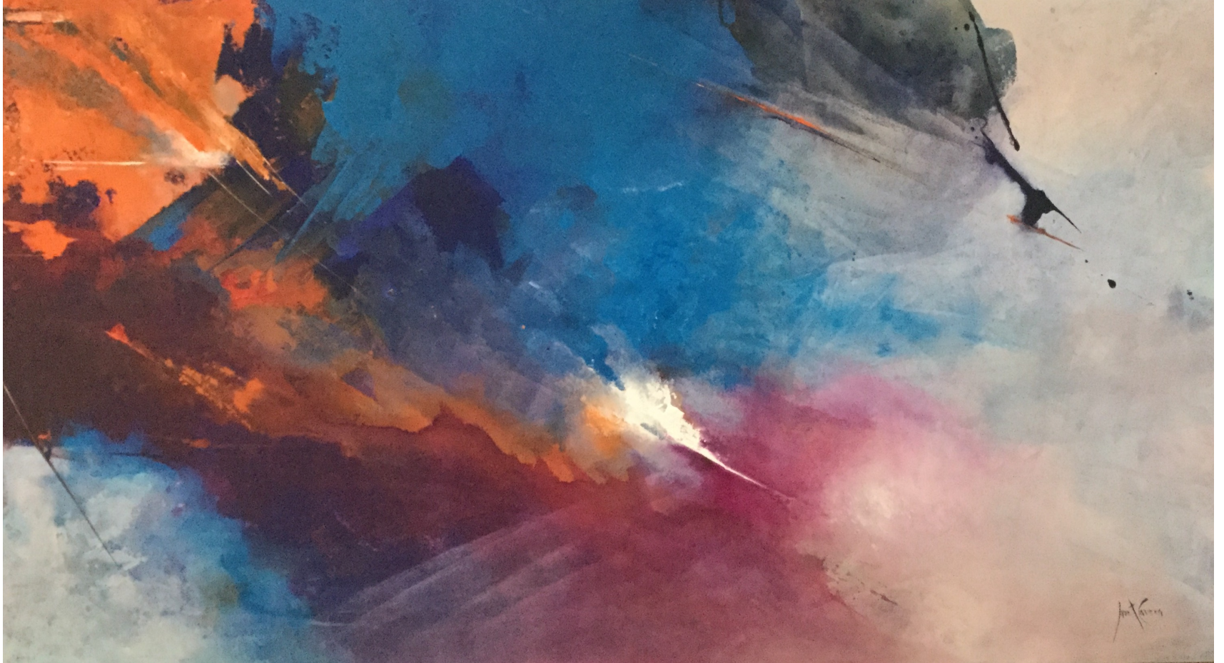
Kites Acrylic 31.4 x 59 in