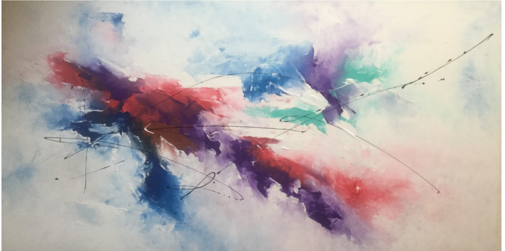
Firmament Acrylic, 2019 31.4 x 59 in