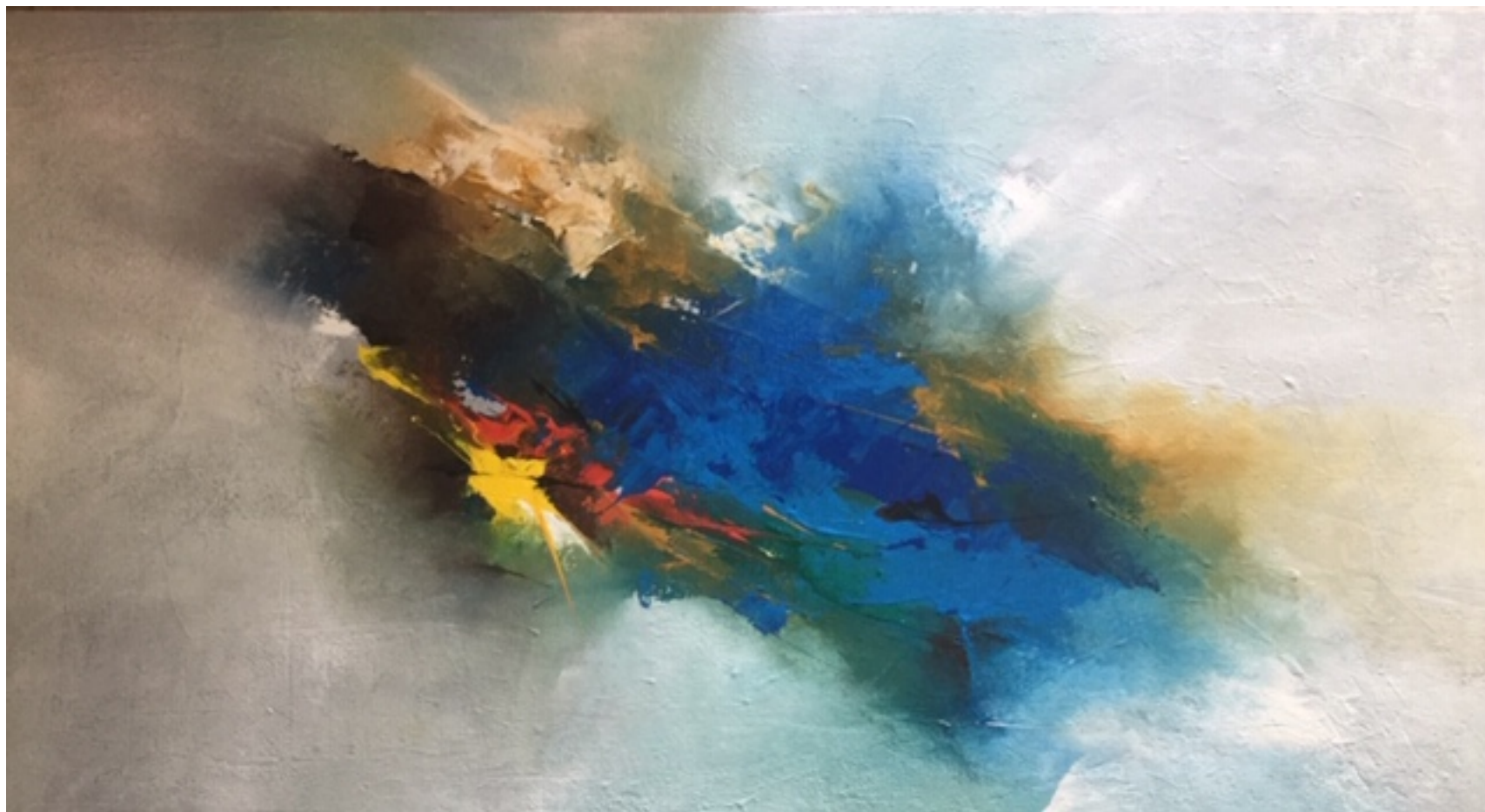
Life Path Acrylic, 2019 31.4 x 59 in