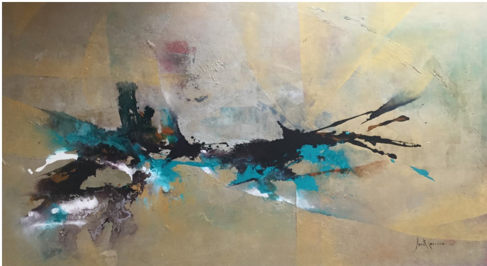
Interventios Acrylic, 2019 31.4 x 59 in