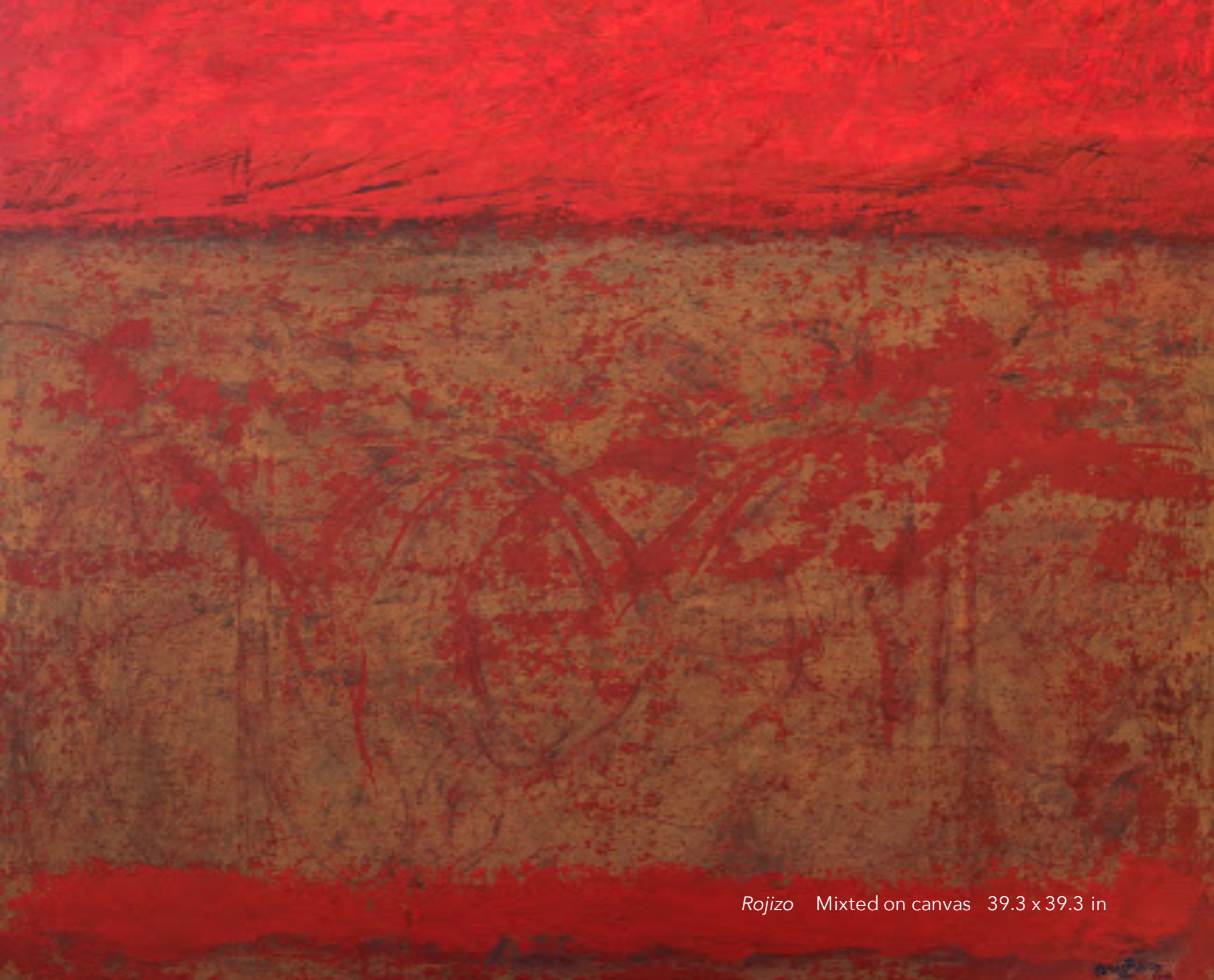
Rojizo Mixed on canvas 39.3 x 39.3 in