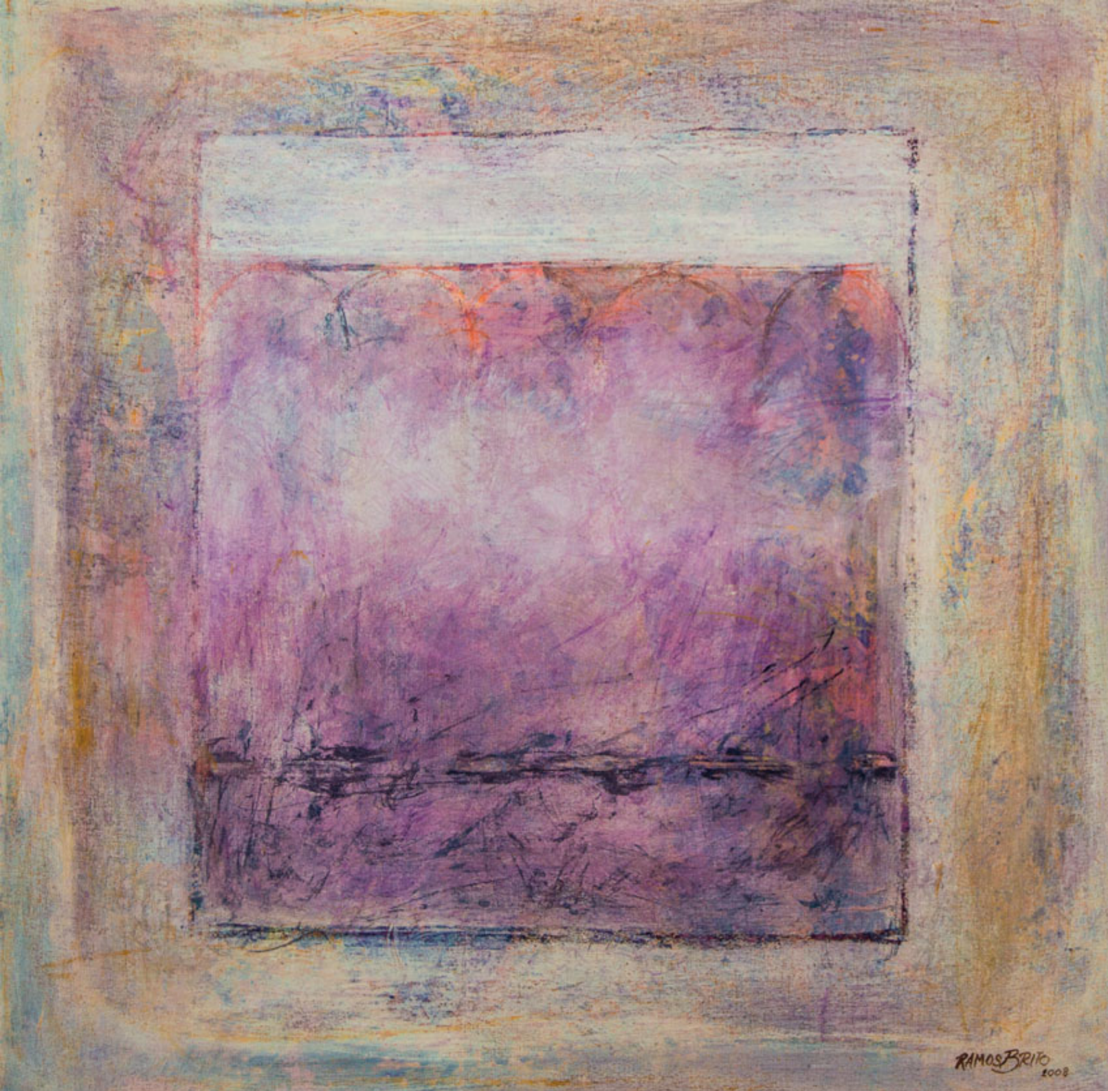
NT Mixed on canvas 27.5 x 27.5 in