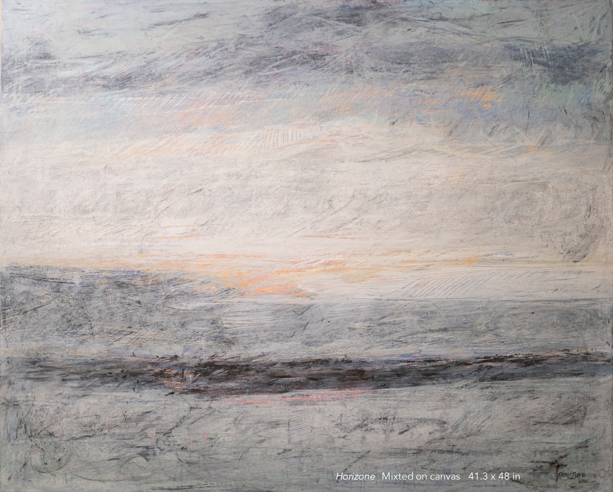
Horizon Mixed on canvas 41.3 x 48 in