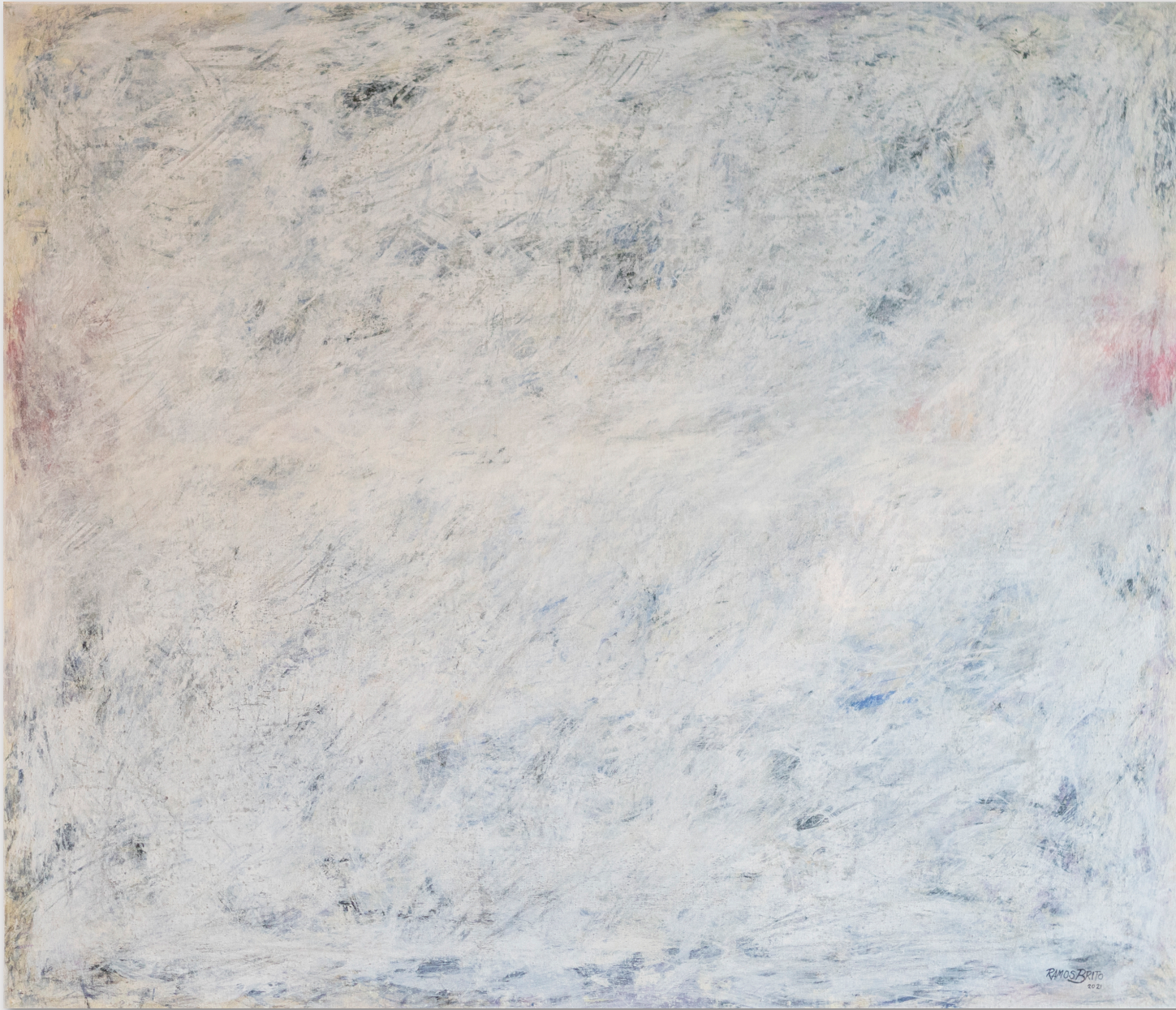
Walk in the Clouds Mixed on canvas 41.3 x 48 in