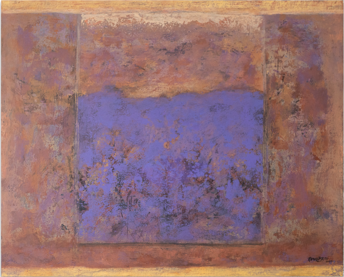
N/T Mixed on canvas / 41.3x 48 in