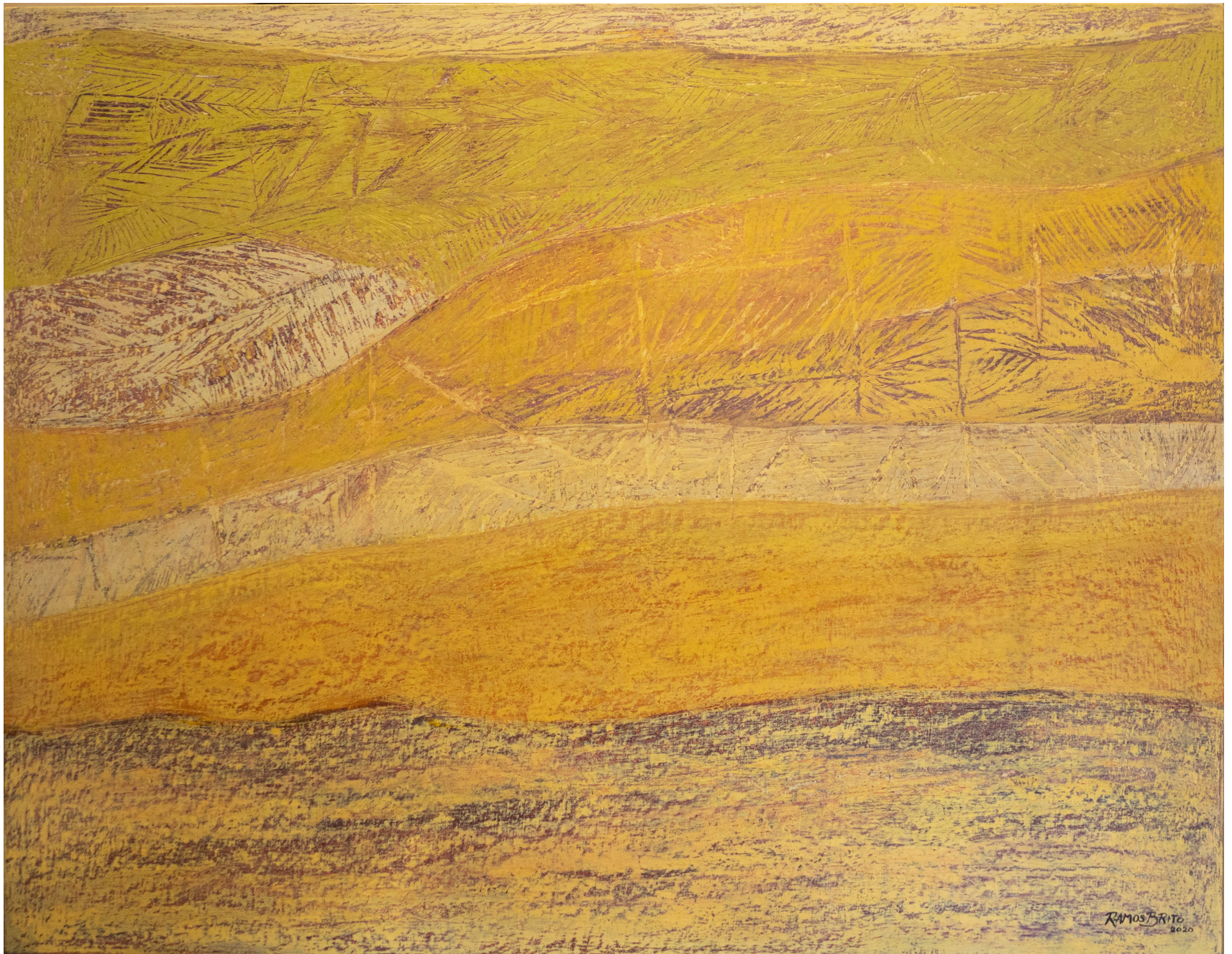
Primitive Mixed on canvas 35.4 x 43.3 in